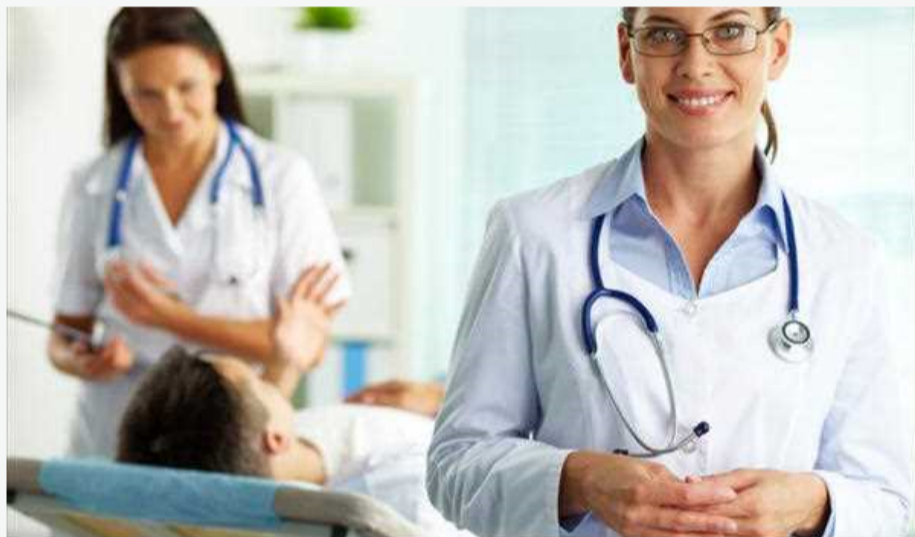
HemorrhoidsHemorrhoidInternal HemorrhoidsExternal HemorrhoidsBowelPilesHemorrhoidal

There are many different ways of dealing with hemorrhoids and this article explains some of the more successful ways to get rid of hemorrhoids including lifestyle changes that are necessary in order to be get rid of piles for good.