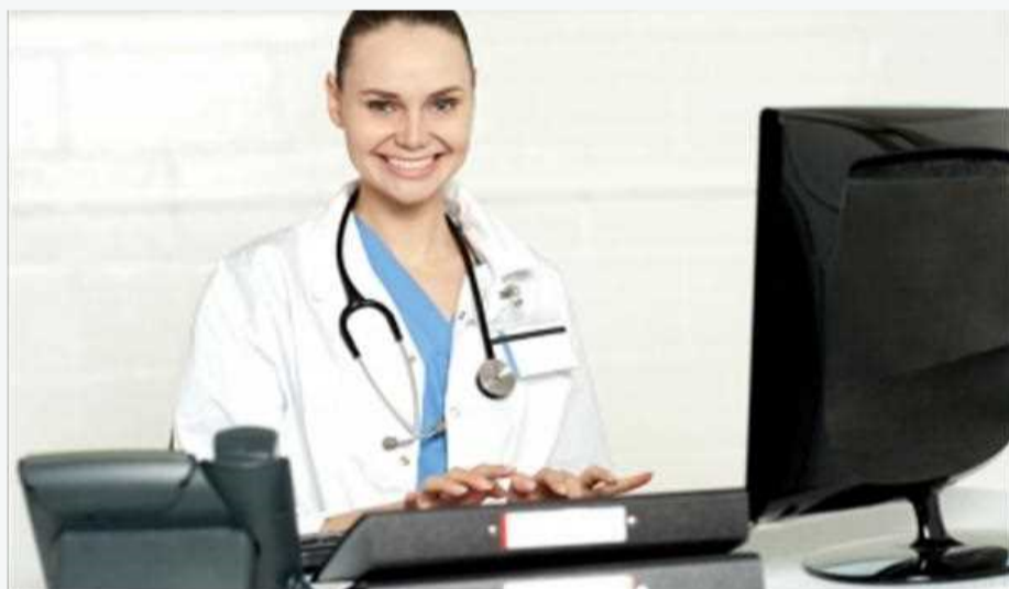
HemorrhoidsHemorrhoidHemorrhoid ReliefHemorrhoids TreatmentsHemorrhoid