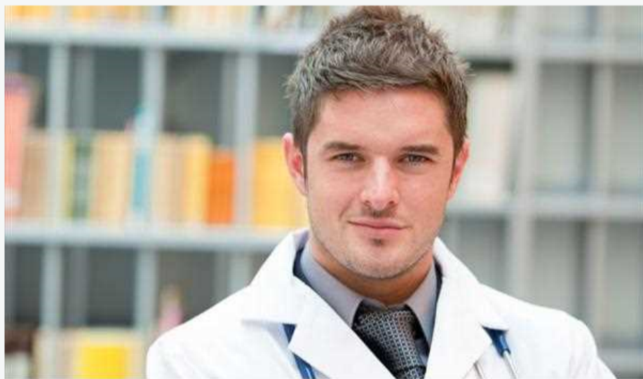
Hemorrhoids Hemorrhoids Homeopathy Piles