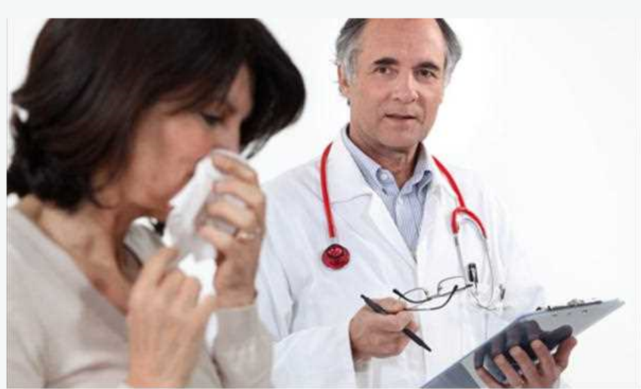
Running and Hemroids

Should you educate yourself about natures solutions to our numerous problems, you will find that hemorrhoids settlement is not as far away as you may have thought. The reason that so many people do not find hemorrhoids relief as fast as they should is that they do not take enough of a vested interest in themselves to learn more about their ailment and more about natural, herbal remedies.